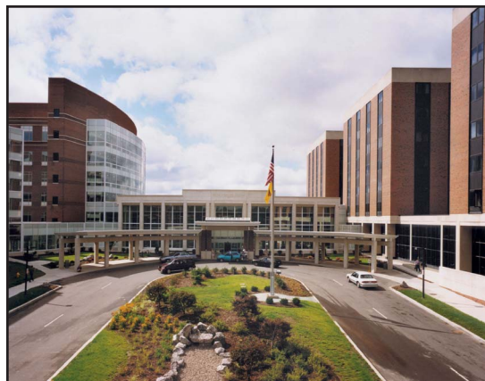
Strong Memorial Hospital